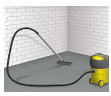
2 Cleaning the substrate