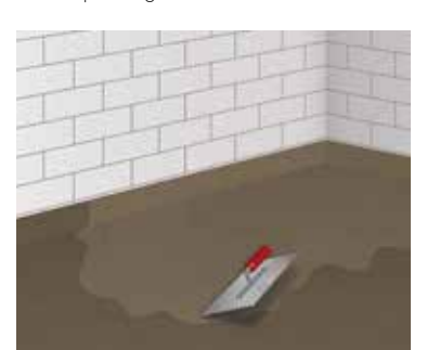
9 Application of the second coat of waterproofing membrane