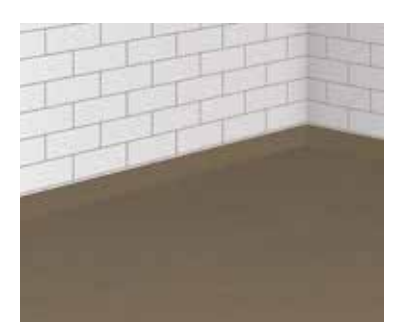
10 Finished waterproofing membrane ready to receive finishes