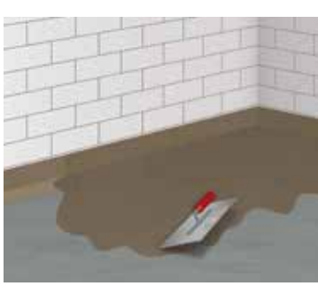
7 Application of the first coat of waterproofing membrane