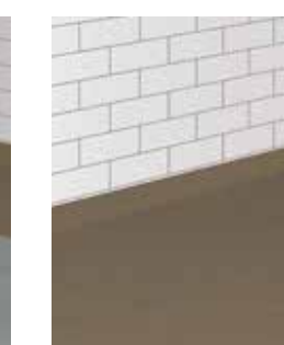
8 Allow the first coat to dry