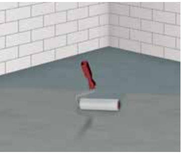
3 Priming the substrate, e.g. with ASO®-Unigrund